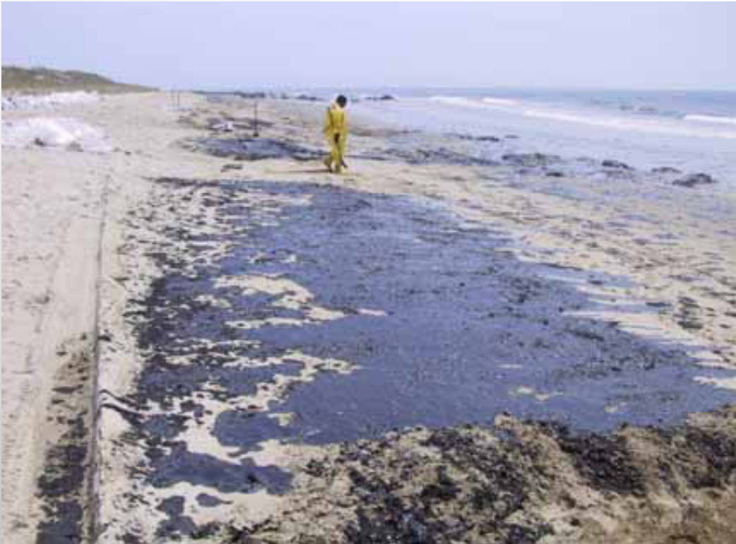
BOUCHARD B1 20

https://www.cerc.usgs.gov/orda_docs/CaseDetails?ID=966