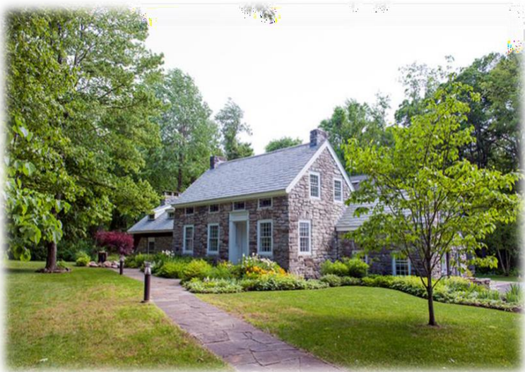
Kelly Adirondack Center at Union College