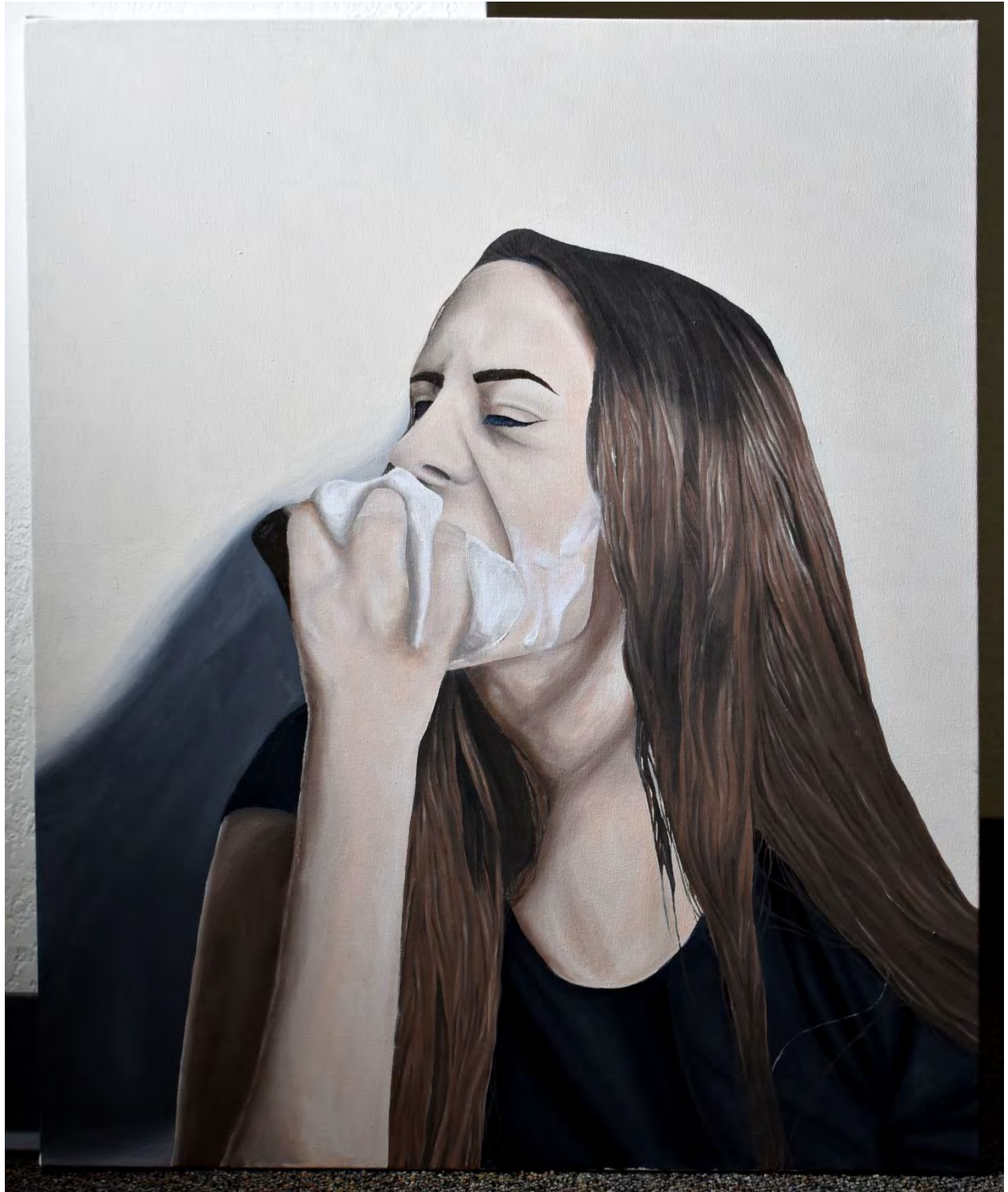
Woman Eating, Oil on Canvas