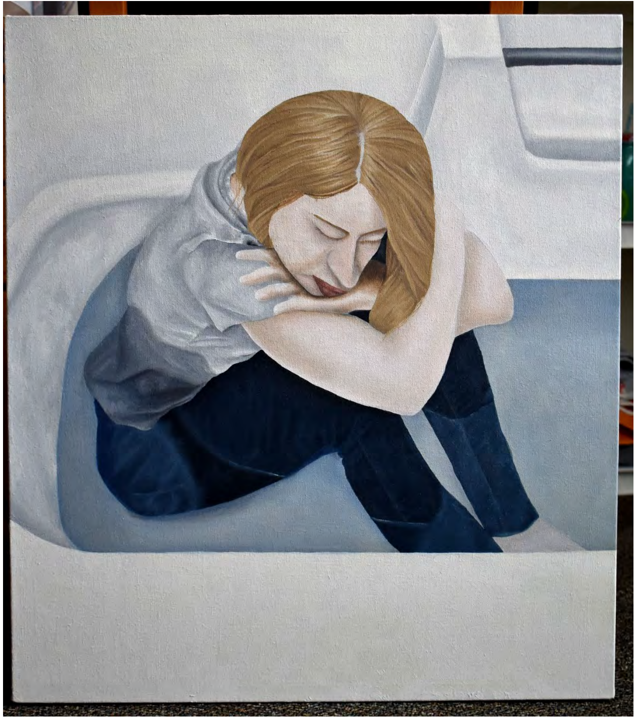
Woman in Tub, Oil on Canvas