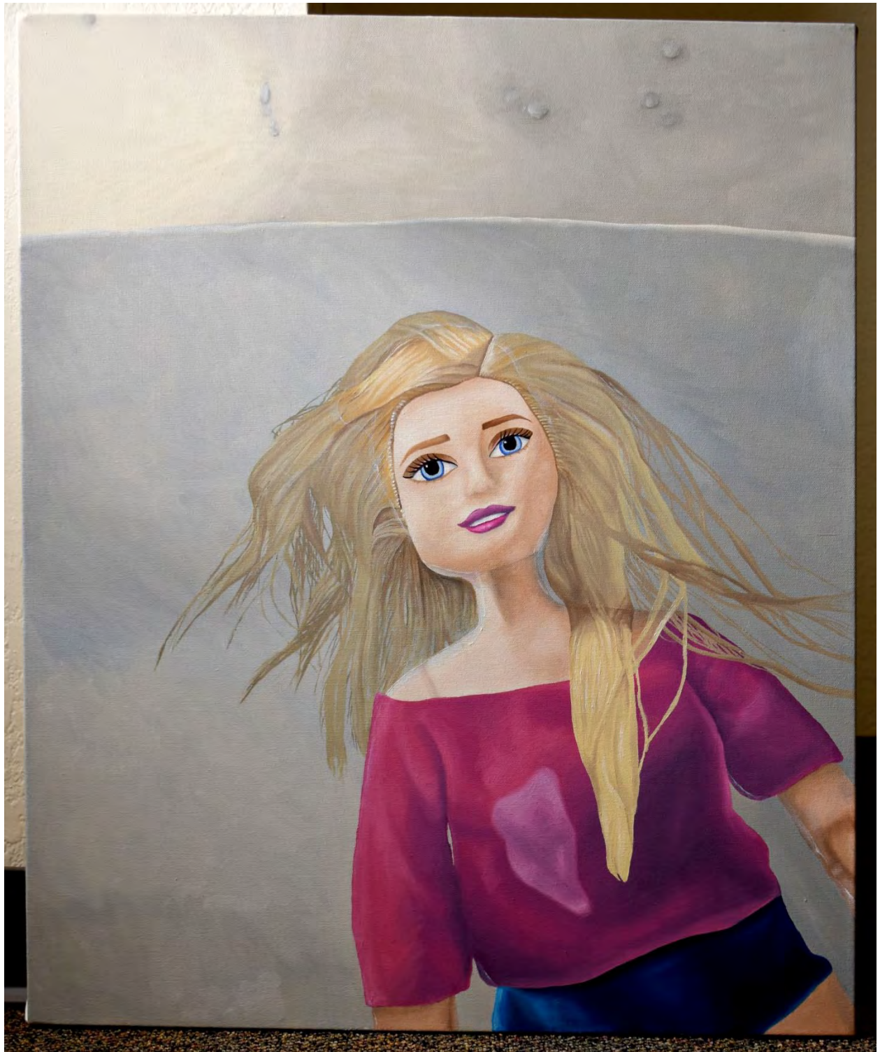
Doll in Tub , Oil on Canvas