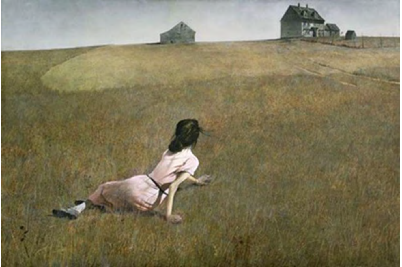
Fig. 3. Andrew Wyeth, Christina's Worlds , 1948, tempera on panel, The Museum of Modern Art, New York, Web, accessed 15 Feb, 2017