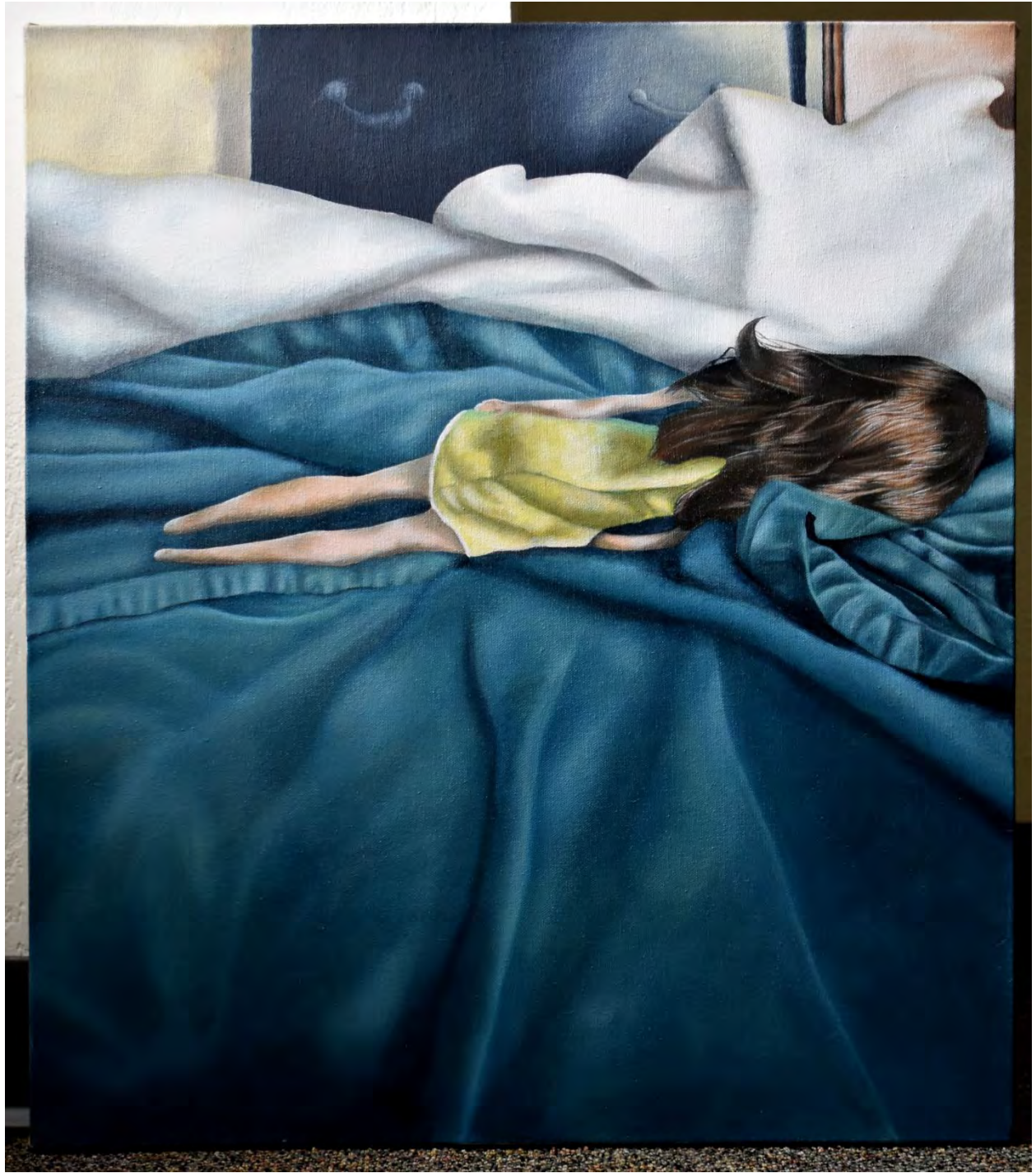
Doll on Bed, Oil on Canvas