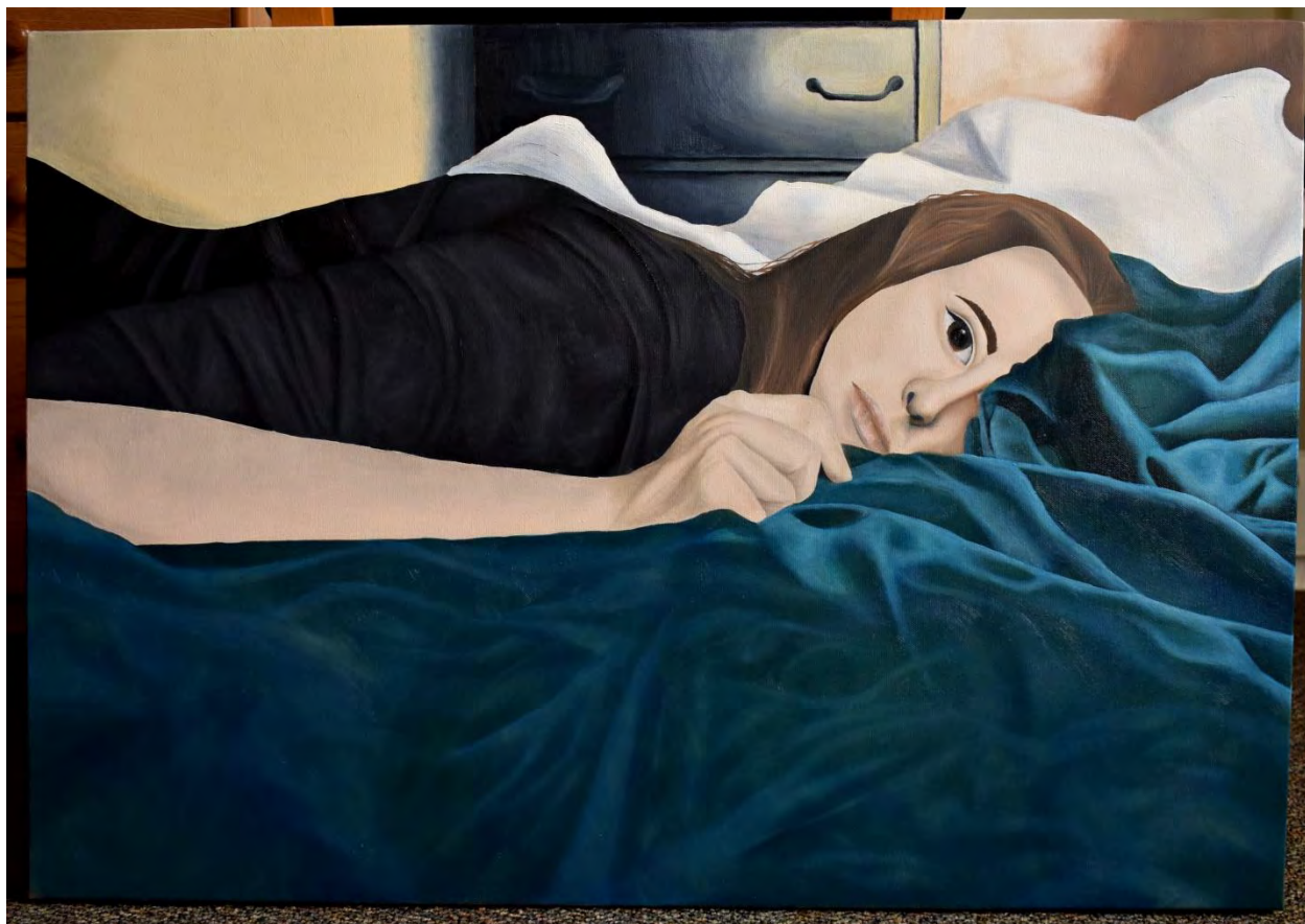
Woman on Bed, Oil on Canvas