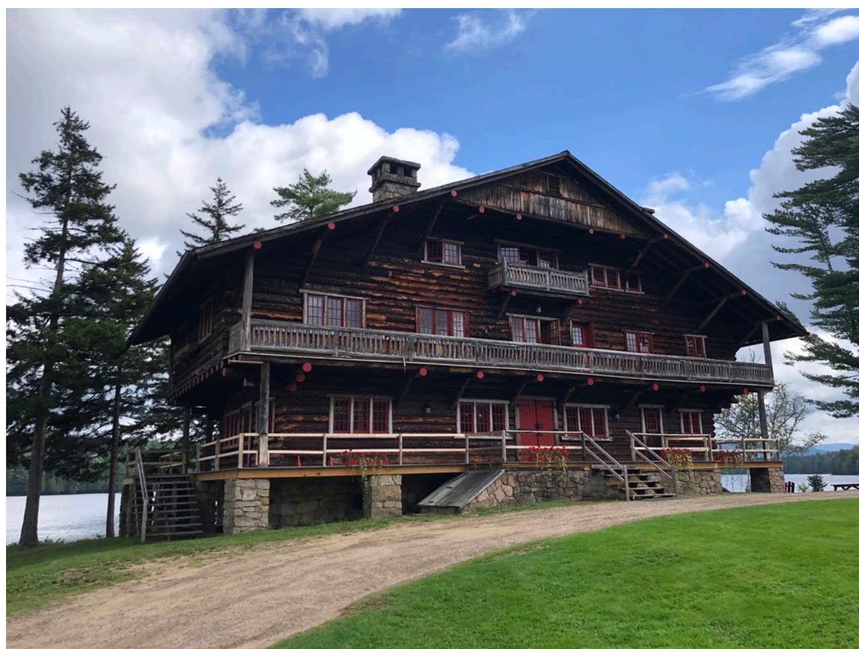
Great Camp Sagamore