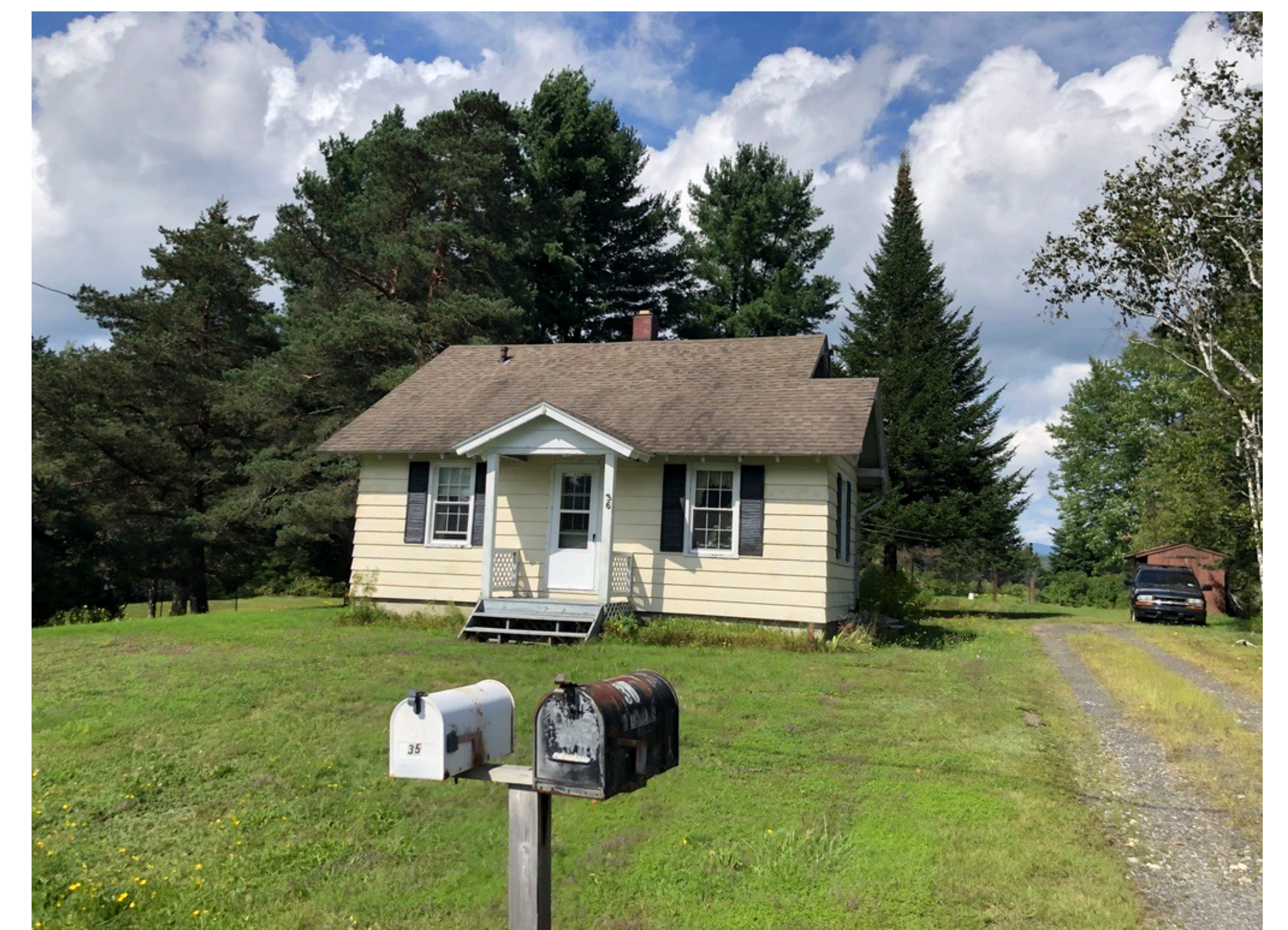
An Adirondack Home