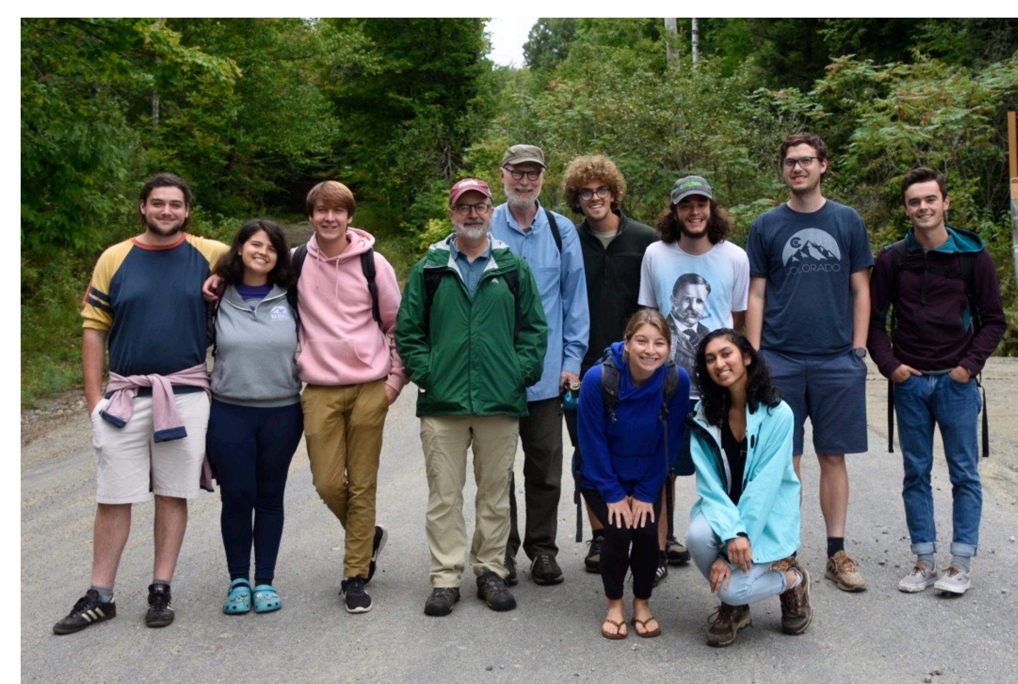
Your 2021 Adirondack Miniterm